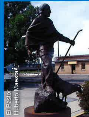
City of Alamosa Permanent Collection