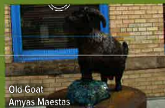
Old Goat Amyas Maestas