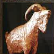
5 Old Goat Amyas Maestas $4,200