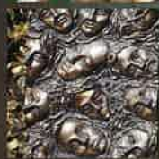
3 Humanity Damian Radice $3,200