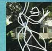
16 Mountain Spell Harold Linke $7,545