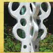
14 Deciduous Kyle Cuniff and Kasia Polkowska $3,500