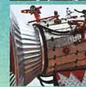
17 The Deluxe Spray-It Fire Rocketship Jimmy Descant $5,000