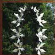
7 Tower Suzanne Kane $7,000