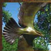
6 Wings of Freedom Dimitry Domani Spiridon $12,000