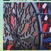
11 Light Hearted Drummer Jodie Bliss $12,000