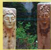
13 Cultural Pedestrians Sue Quinlan $7,200