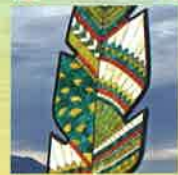
12 Trouvaille Kasia Polkowska and Kyle Cuniff $7,500