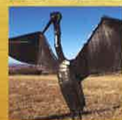
15 Sandhill Cranes Ken Cable $3,000