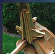
1 Cello Robert Porreca $5,200